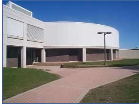
TH&VS over the years