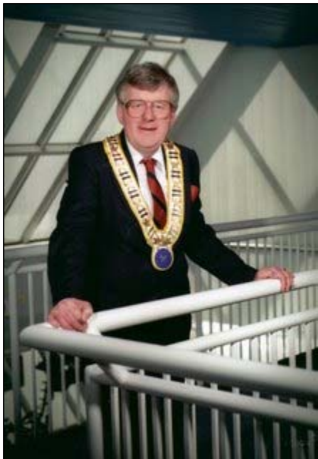
Member of the Order of Canada Timmins Longest Serving Mayor: 1980-1988, 1991-2000 and 2003-2006

Father travelled to Timmins in 1910 and the family lived on Wilson Avenue.