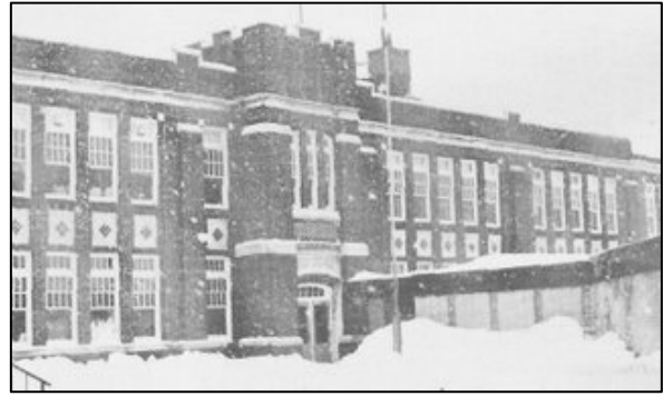
Front entrance of TH on Kent Street

When I attended Timmins High, the school was quite large with a small gym and an auditorium above it. There were no snow days or cold days even when the temperature went to 40°F below zero. There were no school buses in those days. School hours were from 9:00am to 12:00 noon and from 1:30 to 4:00pm. We had no cafeteria and most went home for lunch.