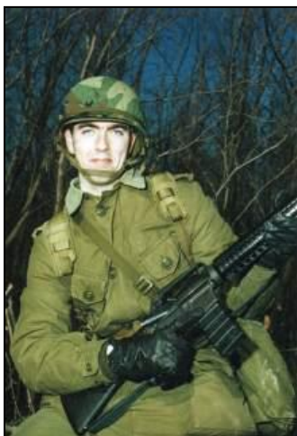
Left: Basic Training March 1996 - “I’ll show them intimidation!”